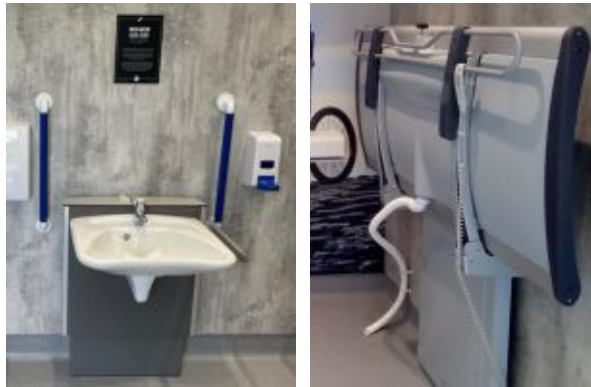
^ Premium Equipment: As always, our CP Pod at Doncaster Cycle Track features leading specialist equipment throughout.