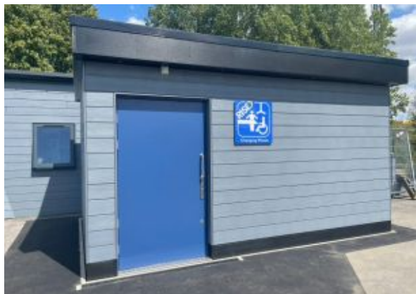
^ Mirror Image: The CP Pod is clad in grey Cedral click weatherboard to perfectly match the adjacent café exterior.