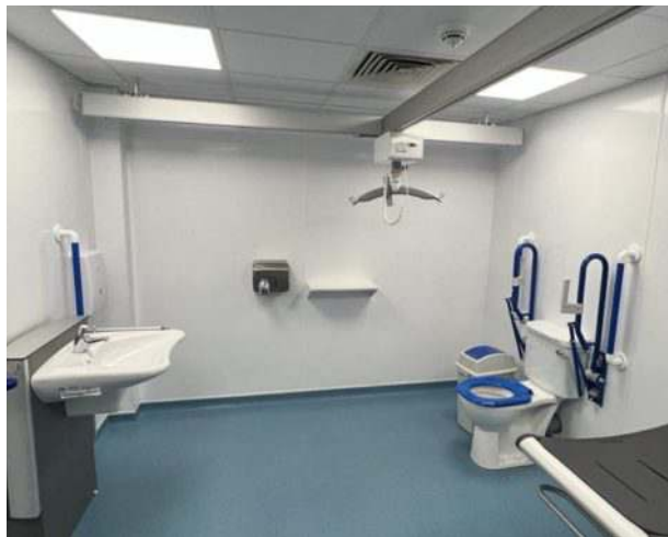
▲ The facility is kitted-out with ceiling track hoist system, height-adjustable basin and adult changing bench.

Cineworld saw the recent refurbishment of their Hull site as a great opportunity to respond to customer requests and incorporate a new Changing Places toilet into their venue.