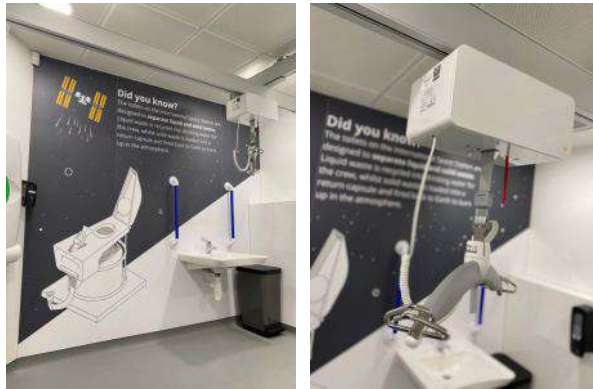
Left: Graphic feature wall designed by the NSC crew. Right: Guldmann GH3 ceiling track hoist system.