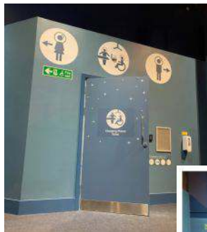
Before & After: We didn't just install the equipment, we created the room itself – from the initial architectural design to Building Regs approval, and everything in between.