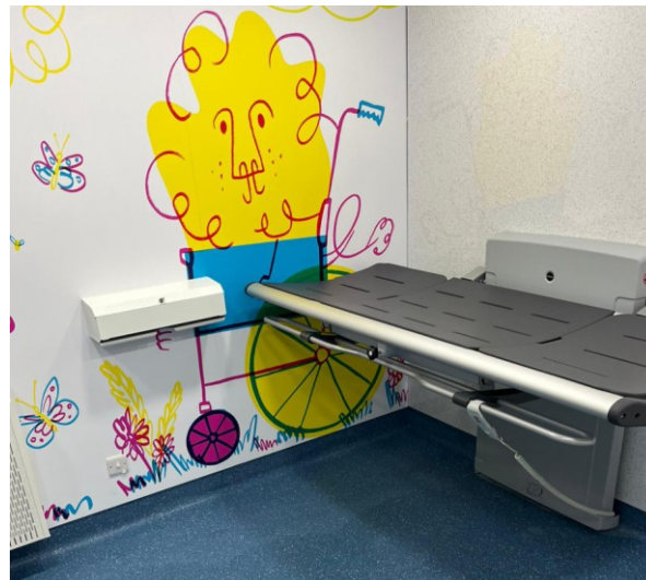
📌 Premium Finish: The CPT includes anti-slip flooring, suspended ceiling, high-impact wall panelling, and custom feature graphics.