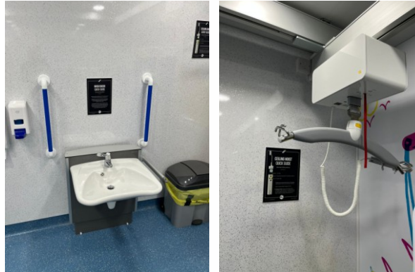
^ Fully Compliant: The CPT contains premium equipment throughout and is registered with the Changing Places Consortium.

"The National Trust is for everyone, and we want to make it easy for all visitors to enjoy the places we care for. The new hub at Sudbury is a great example of this – it's inclusive, high quality, and something that we're extremely proud of."