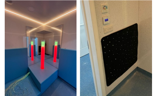
^ Enhanced Provision: The additional sensory room is an extremely progressive addition, and will hugely benefit neurodiverse visitors.

For further information about Changing Places toilets or to schedule a free consultation, please call 07729 224 738 or email hello@riseadapt.co.uk