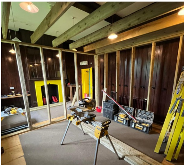
📌 Room Within a Room: To pacify the Local Planning Authority, all works were complete with minimal impact to the original building.

The new Changing Places features premium materials throughout and includes a height-adjustable changing bench, basin, and ceiling track hoist system, as well as graphic feature wall and all other fixtures required to fully register the facility. The smaller sensory room features a host of specialist lighting and audio equipment to calm and engage neurodiverse visitors.