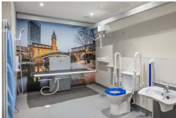
⚡ The Station's facility is kitted-out with ceiling track hoist system, height-adjustable basin and adult changing bench.

Our scope of works included the initial dig-out for drainage; preparation of the room itself, installing wall panelling, safety flooring and suspended ceiling; first and second fix plumbing and electrics; and the installation and commissioning of all specialist equipment. In short, we transformed an empty shell into a welcoming and fully compliant Changing Places toilet, complete with custom feature wall.