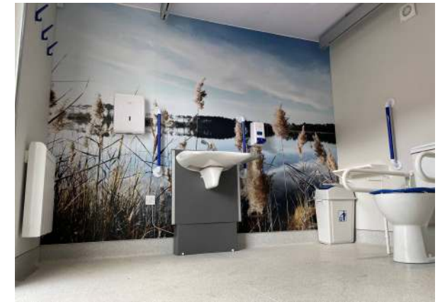
^ Inside the facility: Premium equipment specified throughout.

We were more than happy on this occasion to activate our High Five Promise and help with the cost of this modular facility. Local fundraisers had done so much already, and it is clear just how much Changing Places toilets are benefiting this local community.