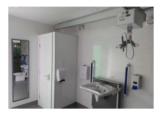
High-Spec: Both pods are finished with premium materials and specialist equipment, as per our installation at Shorne Woods park.