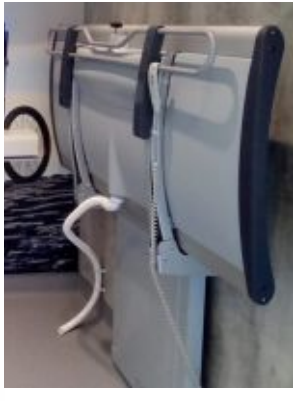
Premium Equipment: As always, our CP Pod at Doncaster Cycle Track features leading specialist equipment throughout.